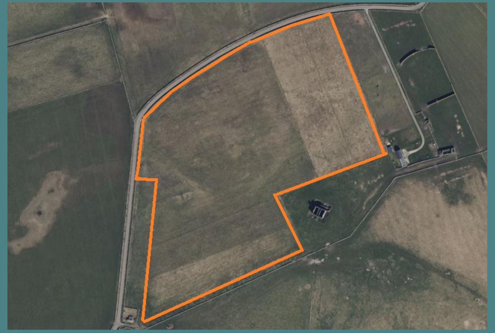
19.63 acres or thereby at Geramount, Sanday, KW17 2BL OFFERS OVER £40,000