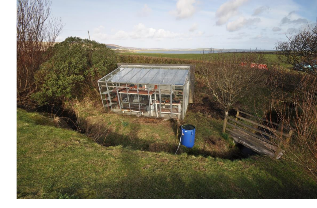
SERVICES – Mains water and electricity. Private septic tank.

COUNCIL TAX BAND – Band D. The Council Tax Band may be reassessed by the Orkney Joint Valuation Board when the property is sold. This may result in the band being altered.