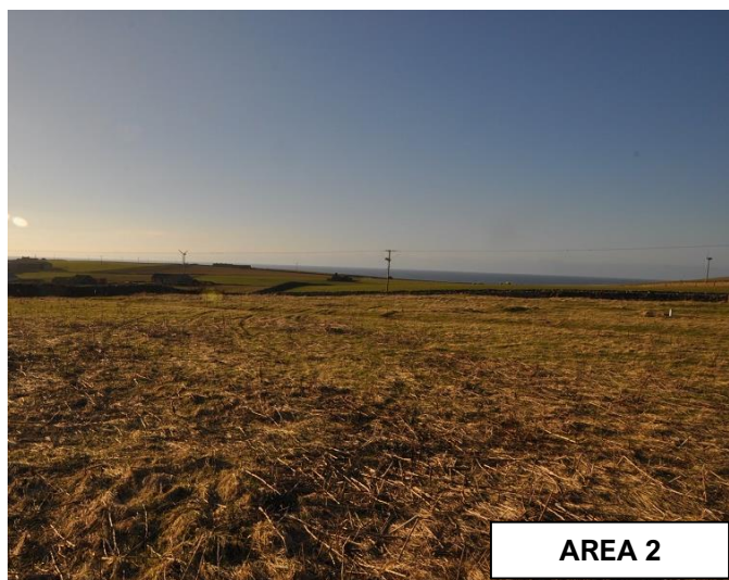
SERVICES - Purchasers will be liable for taking services to the land.