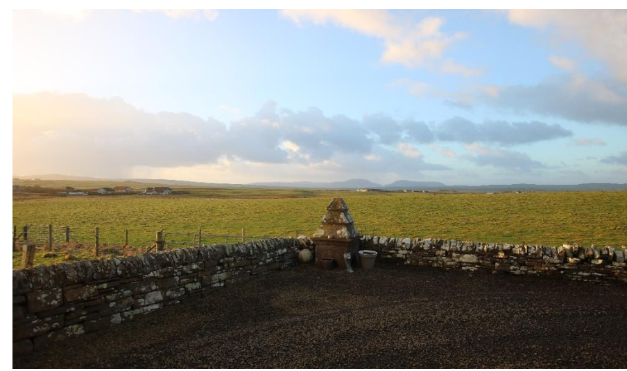
RJF The following notes are of crucial importance to intending viewers and/or